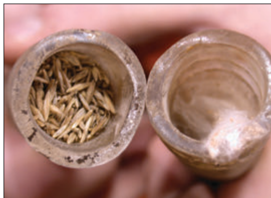
Figure 1. Seed tube on left plugged with old seed from a previous use and tube on right plugged with a spider web. All seed tubes should be checked for obstructions before each use to avoid skipped rows resulting from plugged tubes.

This method can be used to calibrate the drill before entering the field. Become familiar with the calibration mechanism on the drill before starting the calibration procedure. Some no-till drills have a single control meter for adjusting the seed flow from the seed box. Others have two control meters, one for each side of the seed box. In that case, the seed flow must be checked for both sides of the seed box. Because of equipment wear or uneven adjustment, it is common for each control meter to have a slightly different setting to deliver the same rate of seed.