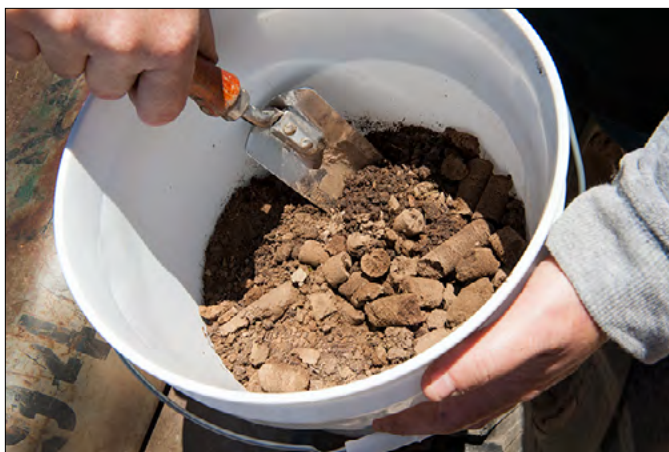
Figure 5. Use a clean hand tool to mix the subsamples.