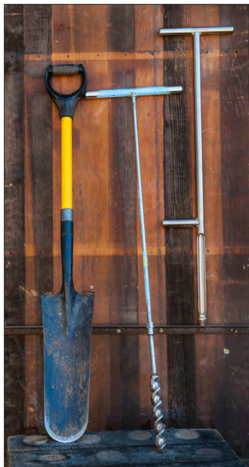
Figure 3. Soil sampling tools.