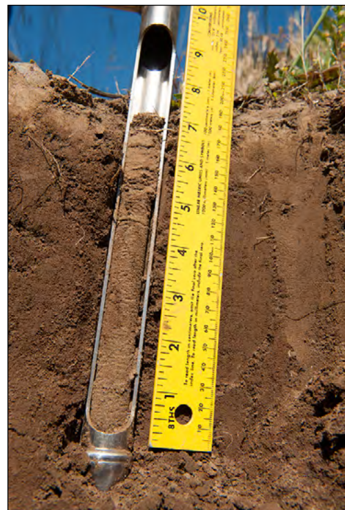
Figure 4. Measuring sampling depth.