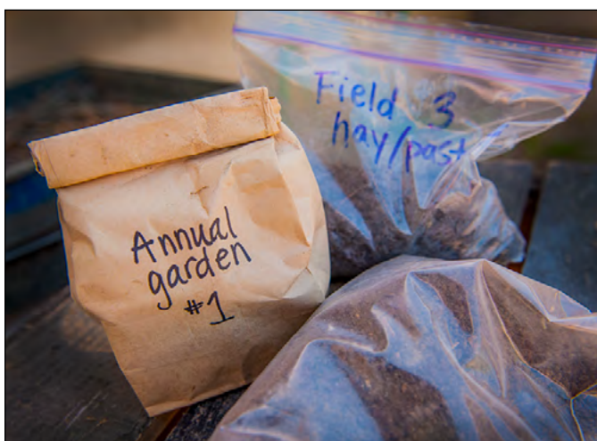
Figure 6. Take a photo of your sample bags before you mail them, for future reference. Do not use a paper bag unless the lab provides one lined with plastic.