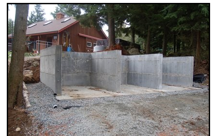
Three bin manure storage