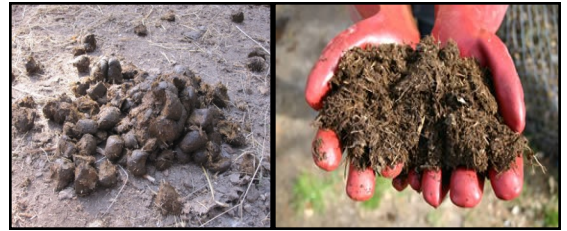
Raw manure and finished compost

All organic matter contains microbial organisms; these are the workers that break down manure, converting it into compost. The microbes have specific temperature, moisture and oxygen requirements. Managing your pile for these three variables will help you produce quality compost in a short amount of time.