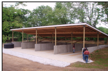
Covered four- section manure storage

A well designed storage area can make manure management more efficient and prevent polluted runoff from entering surface or groundwater.